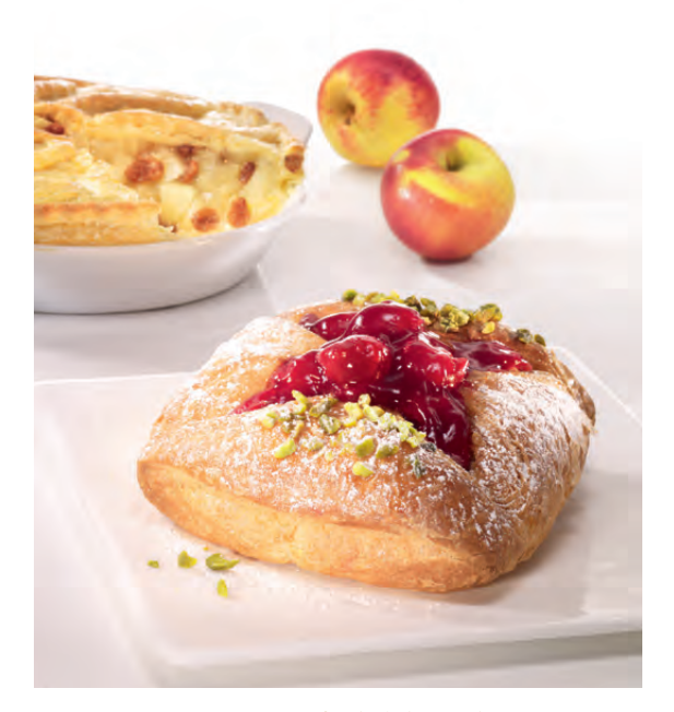
Fruit preparations for the baking industry

Our selection covers a wide product range, for the processing industry and also for final consumers. As a supplier for international and national industries, we produce high-quality fruit and vegetable preparations and raw marzipan. In cooperative partnerships with our B2B customers, we develop custom-made solutions in the respective markets for the dairy, baking and confectionery industries. Our international operations conduct sales worldwide. Our products for final consumers comprise sweet spreads and confectionery and mainly target the German market.