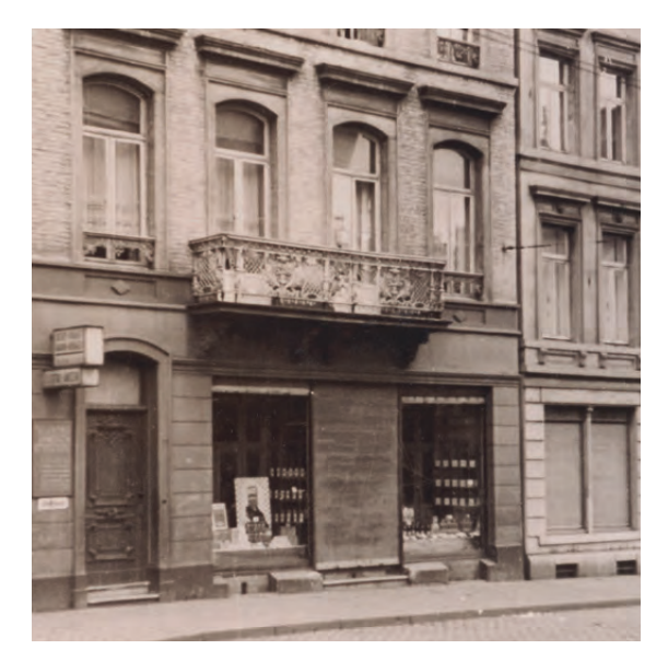
Zentis Colonial Wares Store in the Adalbertsteinweg, 1893

Zentis GmbH & Co. KG is one of Europe's leading fruit processors, supplying fruit and vegetable preparations as well as raw marzipan for the processing dairy, bakery and confectionery industry. The company is also one of the largest producers of jams and sweet spreads. Our company stands for unparalleled expertise in the processing of fruit and other natural raw materials. Zentis is synonymous with first-class products, an uncompromising quality policy and a genuine passion for fruit.