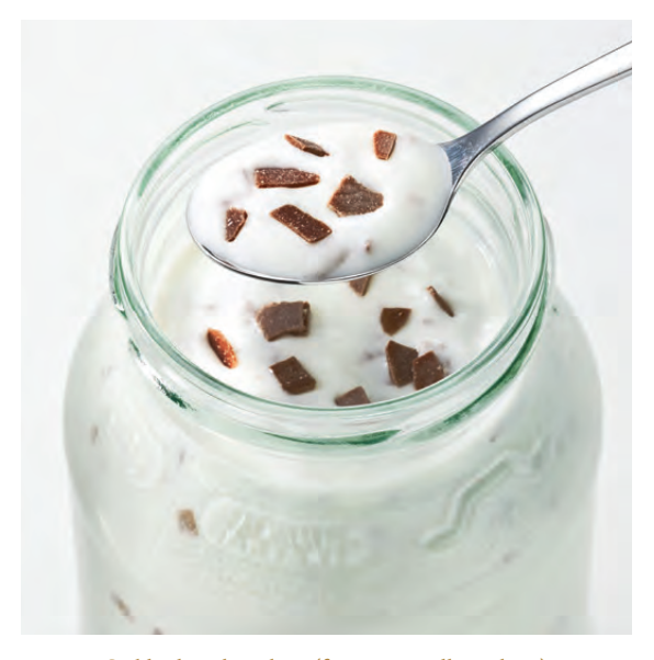
Stable chocolate chips (for stracciatella yoghurt)

Zentis' innovative applications include "swirled dairy products", i.e. the parallel existence of two different creams that are filled into a cup in star form, and firm chocolate chips that remain crunchy even when stirred into yoghurt.