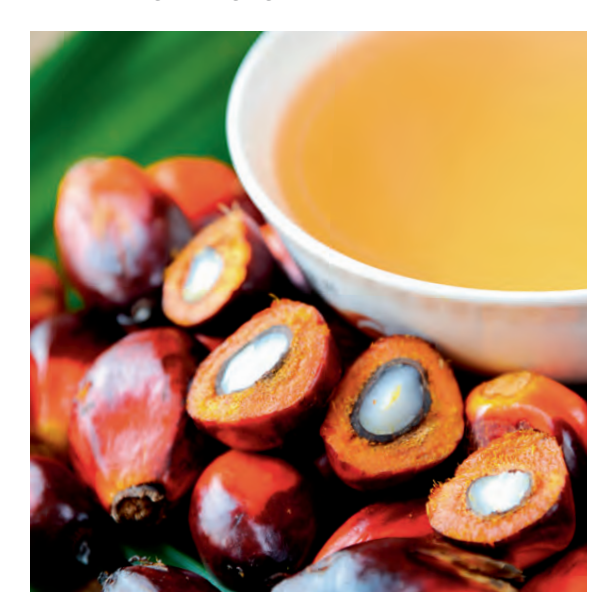
Oil palm fruits

As early as in 2013, all the products for which we purchase palm oil were switched to RSPO mass balance palm oil. In summer 2014, we were able to switch our nut nougat cream articles to the use of sustainable palm oil according to "Segregated".