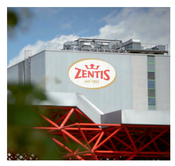
Zentis Aachen-Eilendorf, Plant II

We focus on the following points for the Aachen location: all the direct and indirect greenhouse gas emissions from gas and electricity and the total volume of recycled, reused water. The amount of raw materials processed shown as a percentage for which the risk of child labour cannot be completely ruled out. The number of accidents and the amount of waste are also documented.