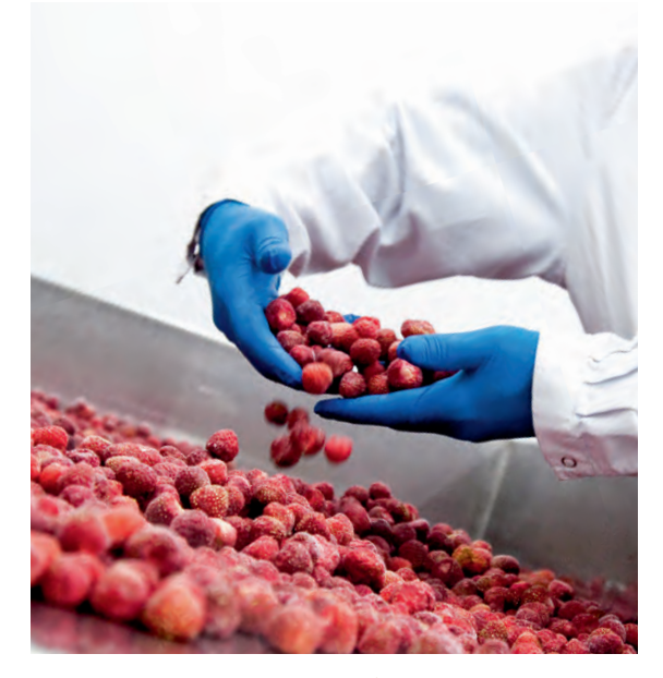
Zentis incoming goods inspection

Every consignment received by us in the company is subjected to a stringent incoming goods inspection. Yet for us, quality assurance applies right from the start. Our close cooperation with suppliers guarantees that our raw materials are traceable right through to the batch used and their exact origin.