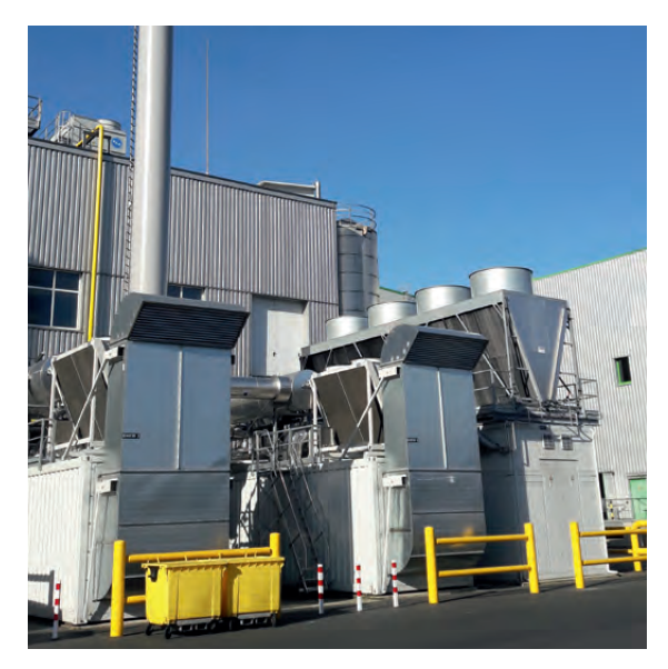
Combined heat and power plants No. 3 and 4

the end of 2017. We have not yet reached the planned target of 70%.