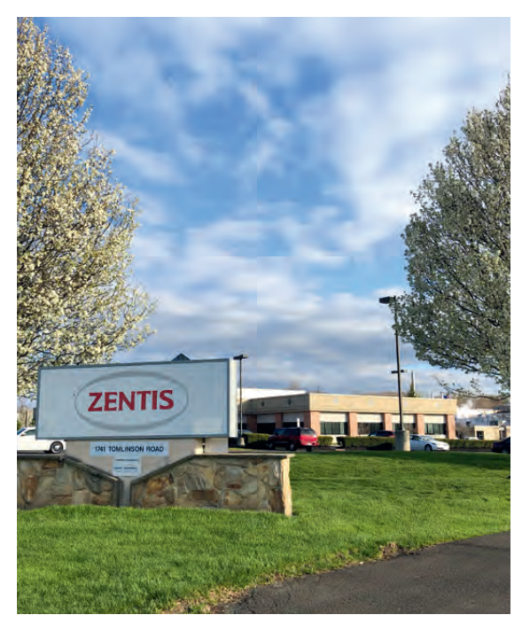
Zentis company premises in Philadelphia (Pennsylvania), USA

We have been active on the American continent with Zentis North America LLC, in Plymouth (Indiana) since 2006. In 2012, two additional sites were added, one in Philadelphia (Pennsylvania) and one in Gardena (California). A total of 444 employees now serve this important market for us and specialise in the manufacturing of fruit preparations for the dairy, ice cream, bakery and beverage industries, as well as in services for bulk consumers, such as catering businesses.