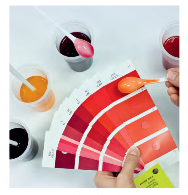
Controlling product colours

For us, environmental protection and quality assurance are inseparable. We guarantee the high quality of our products by way of an uncompromising qualityassuring production process, most modern production facilities, comprehensive analysis methods and experienced employees who have been specially trained.