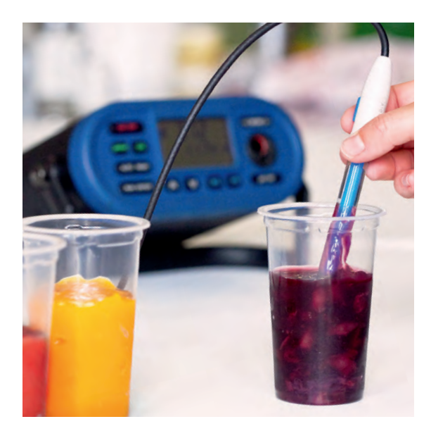
Measuring the pH value

The HACCP system is regularly verified. These evaluation activities serve to guarantee that the aims of safe food production are always met. To ensure this, the facts resulting from HACCP verification are all documented.