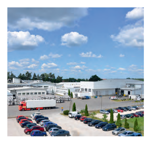
Company premises in Siedlce, Poland

move we are ensuring that products certified according to UTZ criteria can also be sold in other countries from our Polish plant.