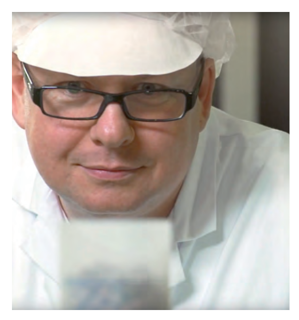
Quality assurance at Zentis

Every day we actively check the RASFF (Rapid Alert System for Food and Feed) reports of the European rapid alert system as a precautionary measure. This gives us a quick overview of current news items on the question of food safety. This enables us to check our raw materials immediately if necessary and inform our customers.