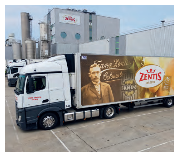
Zentis Aachen-Eilendorf, Plant II

The company operates a fleet of 30 of its own trucks and 130 trailers. The average age of the vehicles in our fleet was 1.7 years in 2017.